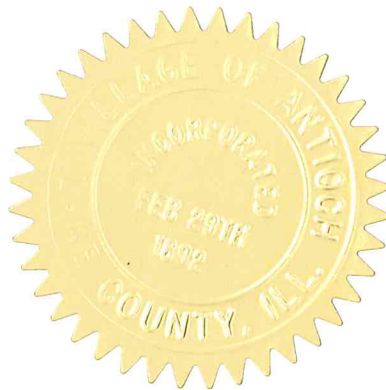
Lori K. ROMINE, RMC/CMC Village Clerk